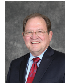
Rusty Senac Chambers County Commissioner Baytown